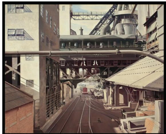
fig. 6 Charles Sheeler, City Interior, 1936, aqueous adhesive and oil on composition board (Masonite), Worcester Art Museum, Elizabeth M. Sawyer Fund in Memory of Jonathan and Elizabeth M. Sawyer.