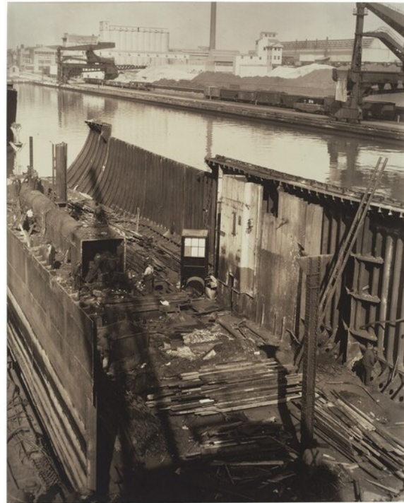
fig. 2 Charles Sheeler, Salvage Ship-Ford Plant , 1927, gelatin silver print, Museum of Fine Arts, Boston.