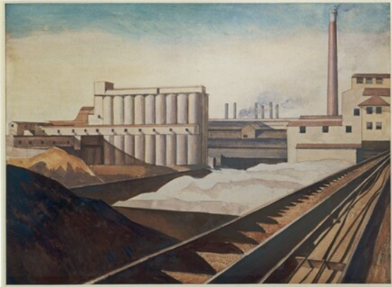
fig. 3 Charles Sheeler, Classic Landscape , 1928, watercolor, gouache, and graphite, Collection of Barney A. Ebsworth