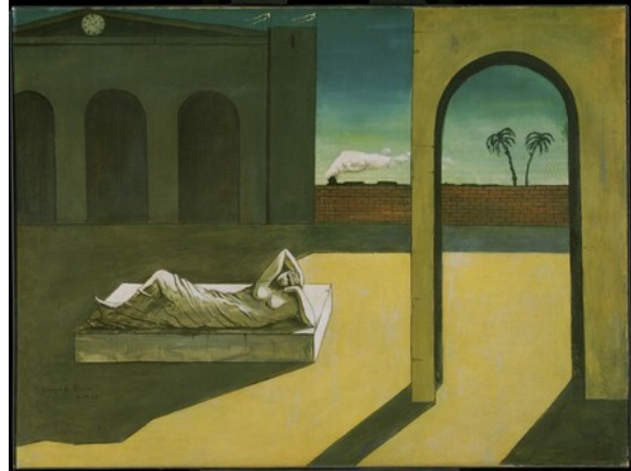
fig. 8 Giorgio de Chirico, The Soothsayer's Recompense , 1913, oil on canvas, Philadelphia Museum of Art, The Louise and Walter Arensberg Collection. © 2016 Artists Rights Society (ARS), New York / SIAE, Rome