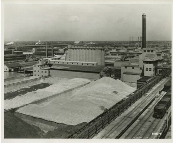
fig. 7 Charles Sheeler, Ford Rouge Cement Plant , 1945, photograph, Collections of The Henry Ford, copy and restrictions apply