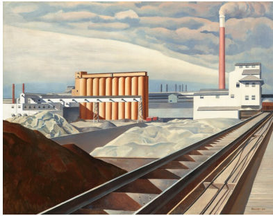
Charles Sheeler American, 1883 - 1965