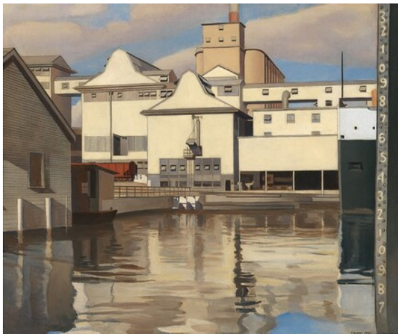
fig. 5 Charles Sheeler, River Rouge Plant , 1932, oil and pencil on canvas, Whitney Museum of American Art, New York, Purchase 32.43