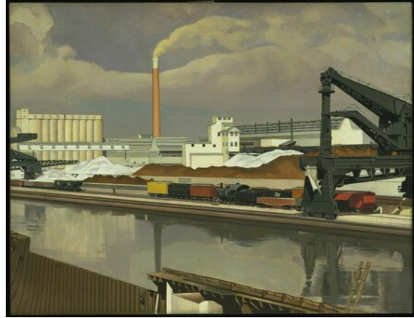
fig. 4 Charles Sheeler, American Landscape , 1930, oil on canvas, The Museum of Modern Art, New York, Gift of Abby Aldrich Rockefeller.