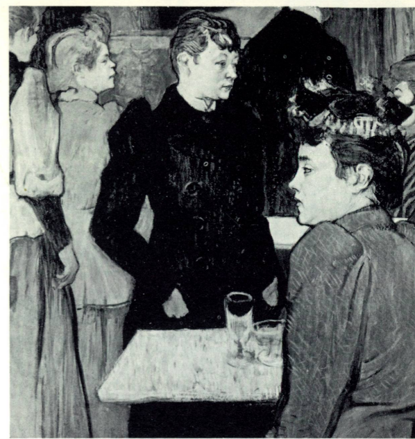
TOULOUSE-LAUTREC. A Corner of the Moulin de la Galette (detail)