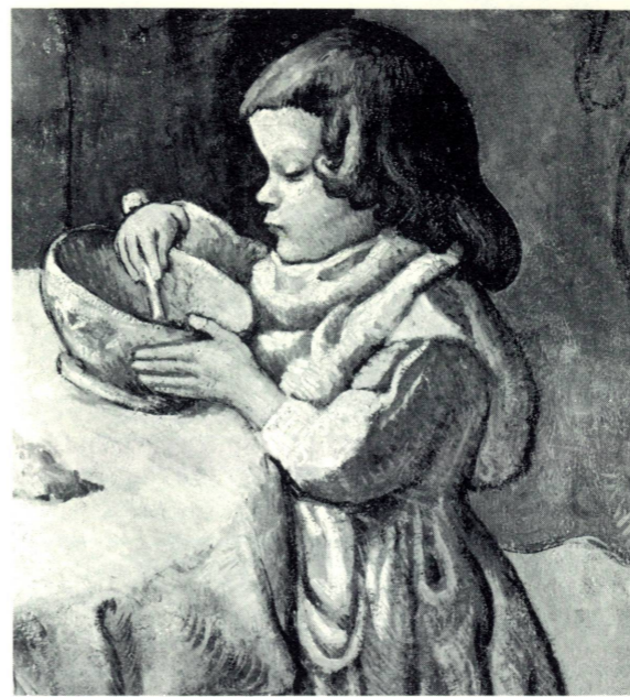
PICASSO. Le Gourmet (detail)