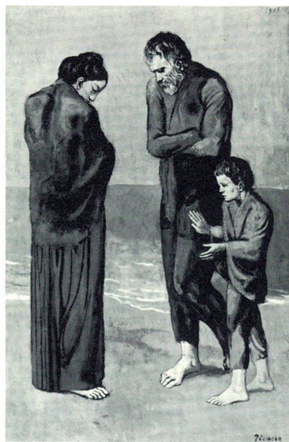
PICASSO. The Tragedy