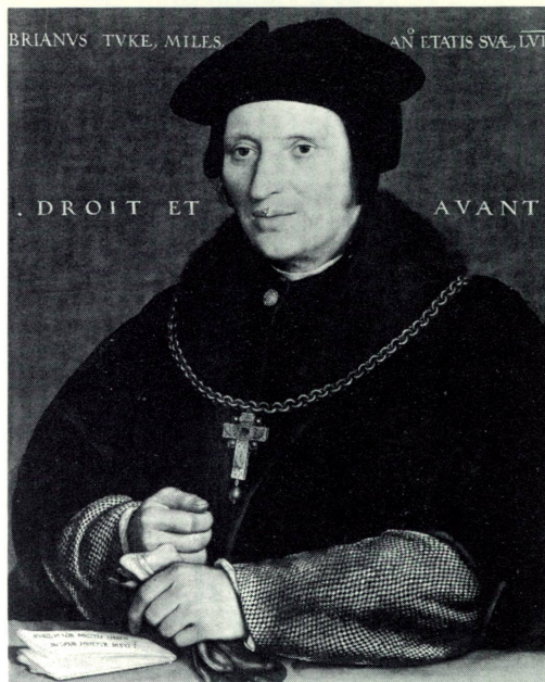
HOLBEIN. Sir Brian Tuke

Weekdays, Luncheon Service 11 a.m. to 2 p.m.; Snack Service 2 p.m. to 4 p.m. Sundays, Dinner Service 2 p.m. to 7 p.m.