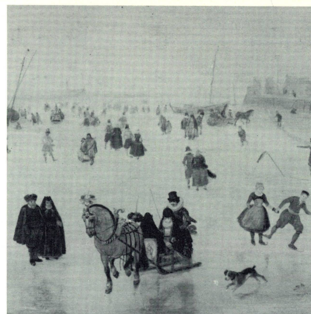
AVERCAMP. A Scene on the Ice (detail)