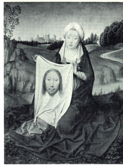
MEMLING. Saint Veronica