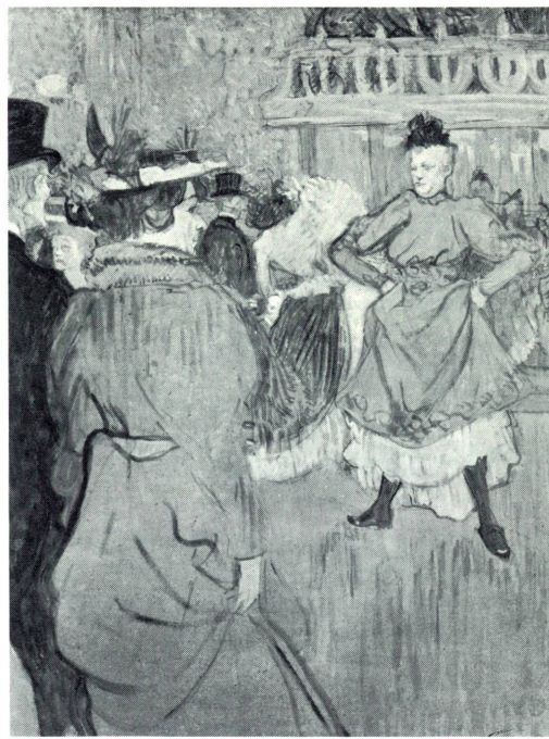
TOULOUSE-LAUTREC. Quadrille at the Moulin Rouge