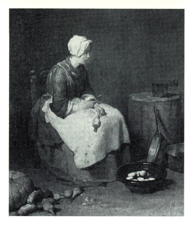
CHARDIN. The Kitchen Maid

31st American Music Festival National Gallery Orchestra Richard Bales, Conductor East Garden Court 7:00