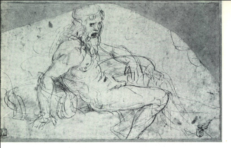
GUILIO ROMANO. A River God Richard King Mellon Charitable Trusts