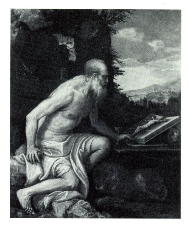
VERONESE. Saint Jerome in the Wilderness