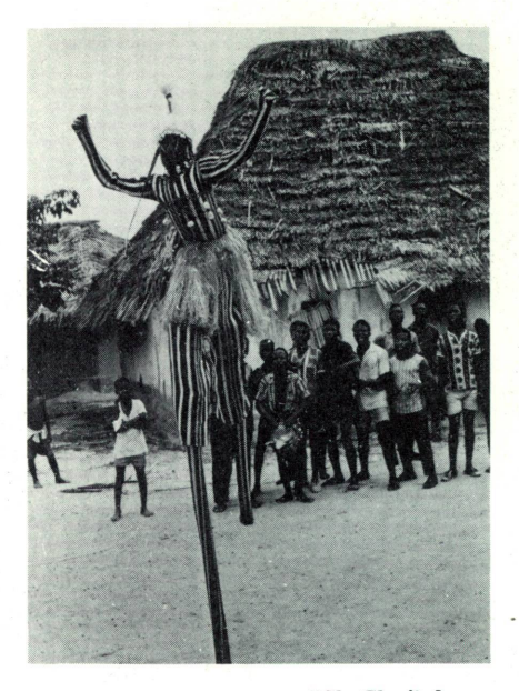
"Gle Gbee" dancer Liberia, Dan