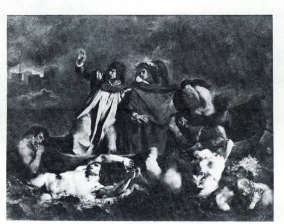
Dante and Virgil in Hell EUGÈNE DELACROIX Lent by the Musée du Louvre

May 15 through September 3 Gallery 93, West Building