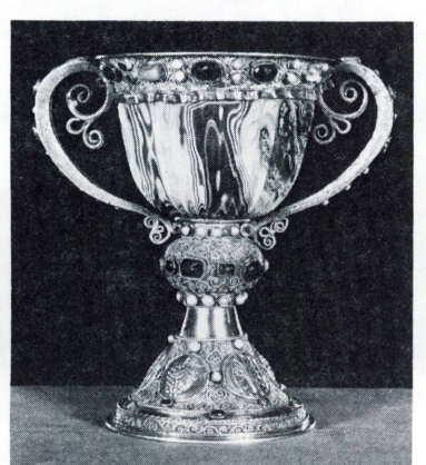
Chalice of the Abbot Suger of Saint-Denis FRENCH, c. 1140 Widener Collection National Gallery of Art, Washington

Wednesday, May 9 5:30 p.m. Auditorium, East Building