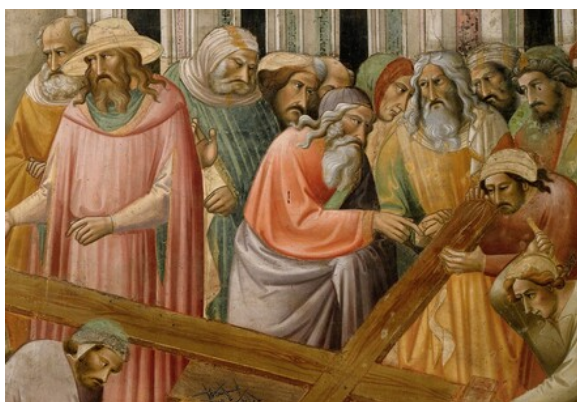
fig. 3 Detail of spectators, Agnolo Gaddi, The Making of the Cross , 1385–1390, fresco, Cappella Maggiore, Santa Croce, Florence.