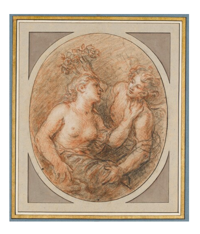
fig. 6 Charles de La Fosse, Zephyr and Flora, c. 1710, red, black, and white chalk, Musée du Louvre, Paris, France.