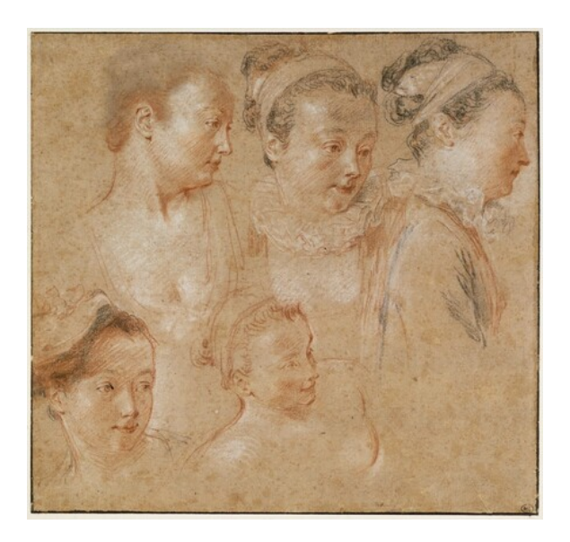
fig. 5 Jean Antoine Watteau, Studies of a Woman, c. 1715, red, black, and white chalk, Musée du Louvre, Paris, France.

French Paintings of the Fifteenth through Eighteenth Centuries