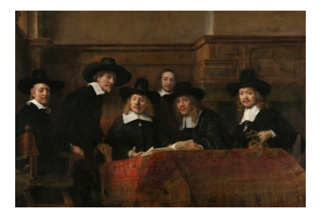
fig. 1 Rembrandt van Rijn, Syndics of the Cloth Drapers' Guild, 1662, oil on canvas, Rijksmuseum, Amsterdam.