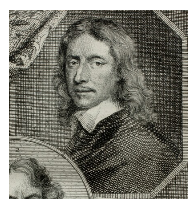
fig. 4 Arnold Houbraken, Govert Flinck , shown in reverse, from De groote schouburgh der Nederlantsche konstschilders en schilderessen , The Hague, 1753

fig. 3 Rembrandt van Rijn, Jan Asselijn , c. 1647, etching, drypoint and burin, National Gallery of Art, Washington, Rosenwald Collection, 1943.3.7137