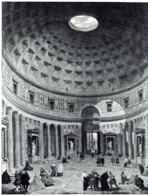
PANINI. The Interior of the Pantheon