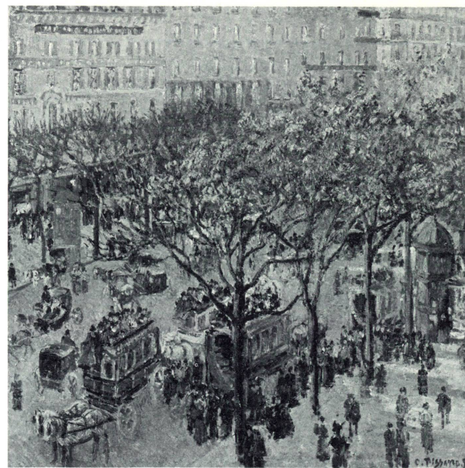
PISSARRO. Boulevard des Italiens, Morning, Sunlight (detail)