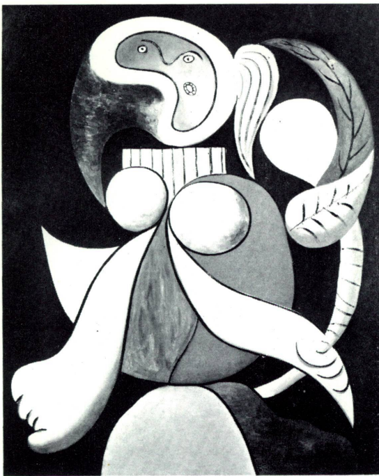
PICASSO. Woman with a Flower Nathan Cummings Collection