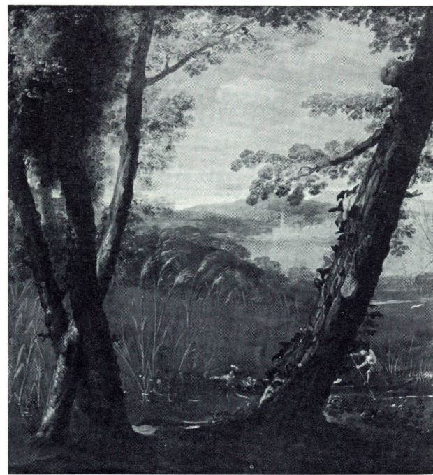
ANNIBALE CARRACCI. Landscape (detail)