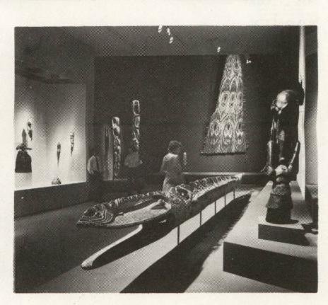
Top, from left: Installation view of the Melanesia section with funerary canoe from New Britain; mask of turtleshell, sennit, wood, human hair and cassowary

feathers from New Guinea; painted wood shield from New Britian; installation view of New Zealand in Melanesia. Middle, from left: Feather mosaic from New Guinea; installation view of masks and a ceiling plant from New Caledonia in Melanesia; female figure of whale tooth ivory from the Tonga Islands; installation view of Hawaii in Polynesia with the war god Ku and feather capes; painted wood figure from New Iceland. Bottom, from left: installation view of New Guinea with painted wood housefront; painted wood cult carving from New Guinea; installation view of wood figures from the New Hebrides in Melanesia; emblem of the crocodile Dema in painted wood, fiber and feathers; installation view of New Guinea with