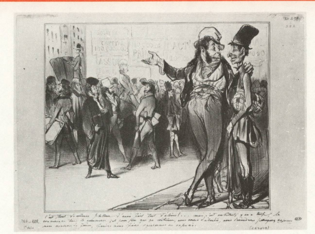
C'est tout de même flatteur. DAUMIER Rosenwald Collection

September 23 through November 25 Print and Drawing Galleries Ground floor, West Building