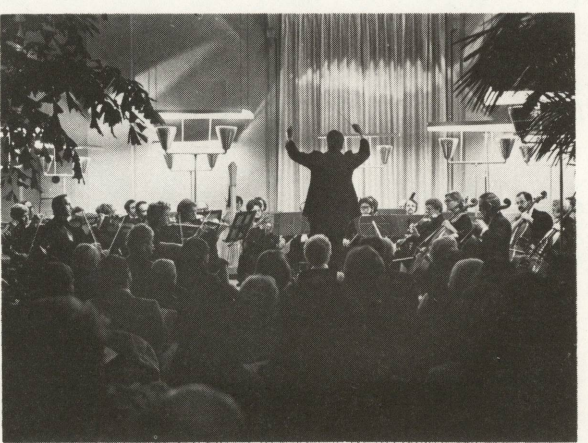
Sunday evening concert in the East Garden Court

7:00 p.m. East Garden Court, West Building