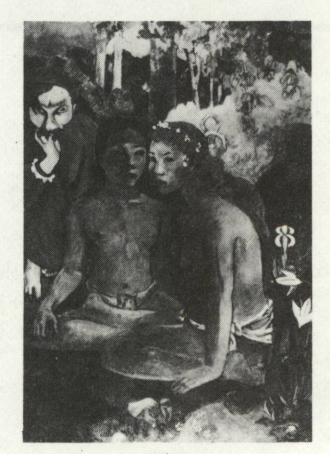
Contes barbares. GAUGUIN Lent by the Folkwang Museum, Essen

Post-Impressionism: Cross-Currents in European and American Painting, 1880-1906