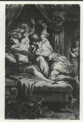
The Rape of Lucretia. GIUSEPPE CADES Lent by The Art Institute of Chicago

Through May 11 Prints and Drawings Galleries Ground floor, West Building