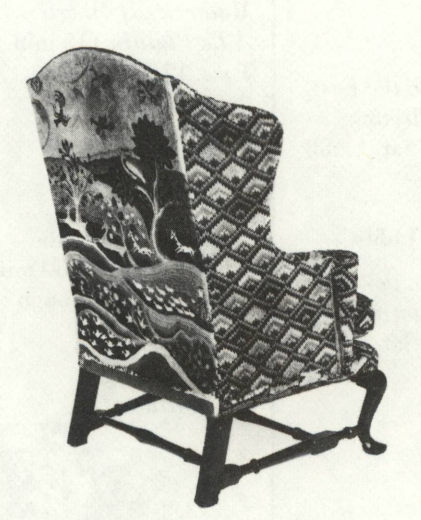
Easy Chair The Metropolitan Museum of Art

Organized by the National Gallery and not scheduled to travel, this exhibition examines luminism, an American phenomenon in art between 1850 and 1875. Over 160 paintings, 49 drawings and watercolors and 47 photographs are included. The luminist style is best seen in the work of five artists: Fitz Hugh Lane, John F. Kensett, Martin Johnson Heade, Sanford Gifford and Frederic E. Church. Paintings by contemporaries and artists related to the movement, by the founding members of the Hudson River school, by those artists who followed luminism, and luminist photography are also on view.