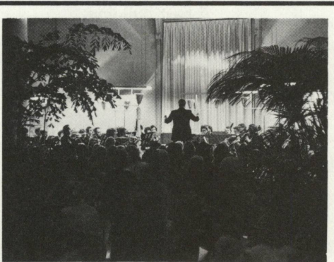
Sunday evening concert in the East Garden Court

The Gallery's 37th American Music Festival begins Sunday, April 13, with the National Gallery Orchestra, Richard Bales, Conductor. This annual festival is devoted entirely to works of American composers dating from colonial times to the present day. The concerts are given in the East Garden Court, West Building, at 7 p.m. each Sunday through June 1.