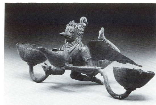
Hanging Lamp , 9th-10th century, Museum Nasional, Jakarta