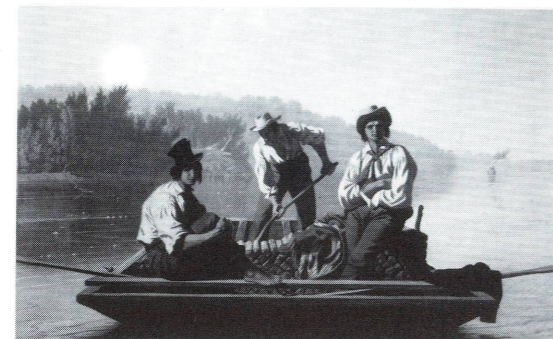
George Caleb Bingham, Boatmen on the Missouri (detail), 1846, The Fine Arts Museums of San Francisco, Gift of Mr. and Mrs. John D. Rockefeller III

The Education Division will offer a special Family Program in conjunction with the George Caleb Bingham exhibition. Colorful Characters , focusing on the people and pastimes represented in Bingham's paintings, will include a tour of the exhibition, storytelling, and a take-home art activity. For children ages 6-10 accompanied by an adult. Programs will take place in the East Building, 11:00-12:30, every Friday and Saturday in August. Preregistration is required for this free program; call the Department of Teacher and School Programs (202) 842-6249.