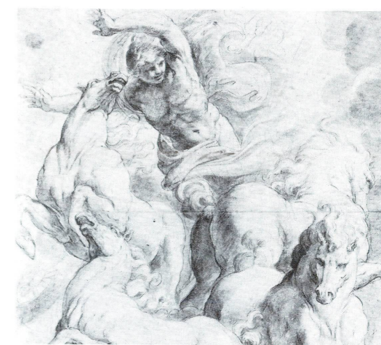
Guido Reni, The Fall of Phaeton (detail), 1596-1603, The National Galleries of Scotland, Edinburgh