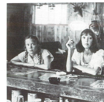
Three Women , 1977, directed by Robert Altman, to be shown August 25 (The Museum of Modern Art/Film Stills Archive)

Taxi Driver (Martin Scorsese, 1976, 114 min.) Sun. 6:00