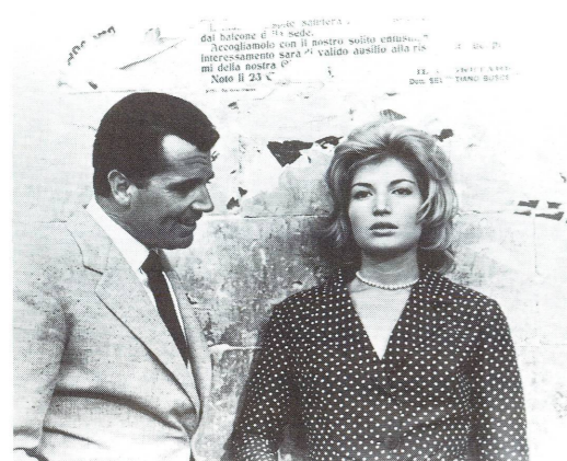
L'Avventura , 1960, directed by Michelangelo Antonioni, to be shown August 4

The East Building will close at 6:00 p.m. on Sundays, but the Fourth Street entrance will remain open only for film audiences