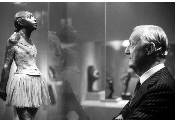
FROM THE COLLECTION