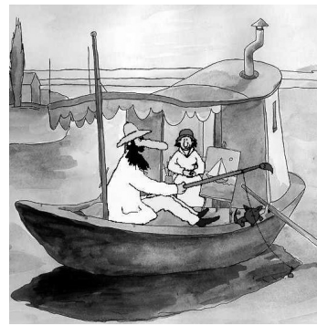
Film still from Getting to Know Leonardo and Monet , screening on May 18–20 as part of the children's film program

Family and Youth Programs are made possible in part by the generosity of the Prince Charitable Trusts.