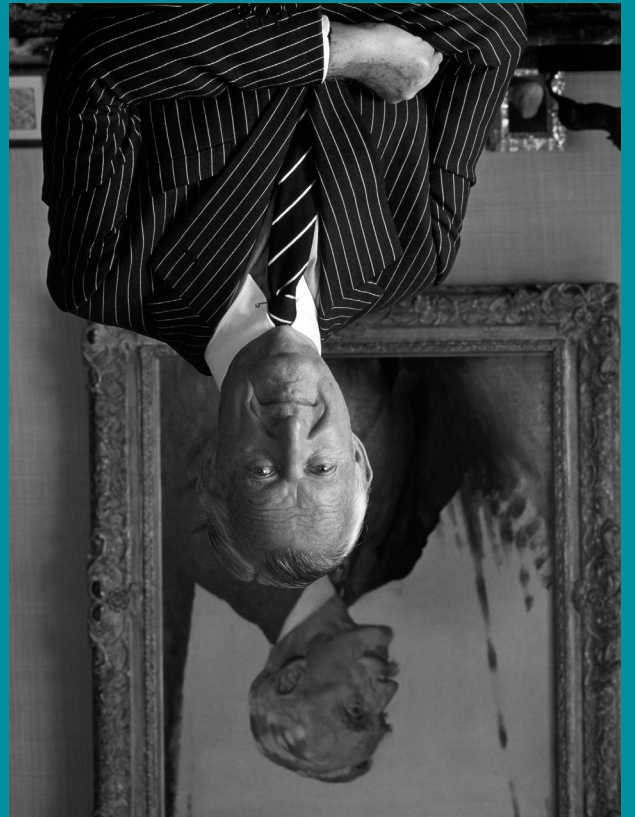
Celebrating the Legacy of Paul Mellon at the National Gallery of Art Through December 31, 2007 LEFT: Paul Mellon, c. 1983, in front of a portrait of his father, Andrew W. Mellon, by Sir William Orpen (1924).